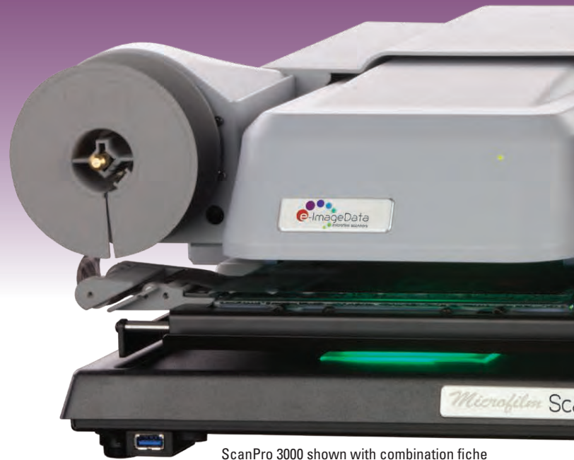
ScanPro 3000 shown with combination fiche and motorized 16/35 mm film carrier

The ScanPro 3000 features a customizable interface that keeps the tool bar simple. Just load your film, click the Film Selection Wizard to automatically set up your scanner , and voilà — your scanner is set up with only the tool bar controls needed for that particular film. The interactive on-screen help menu is always available at your fingertips for questions or more information about how to use any button control. Use the spot-edit feature for live image editing of selected text and pictures while all other areas remain unchanged. In addition, the AUTO-Adjust tool automatically crops and straightens the on-screen image and properly adjusts brightness and contrast , making your image clear and easier to work with. Some patrons have referred to this as the “magic button” but we assure you, no magic is required.